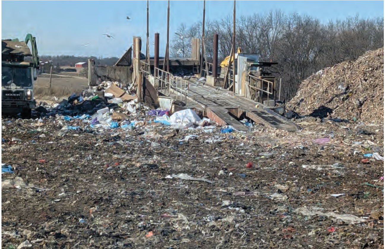
Tipper at Northern edge of active area and aimed West