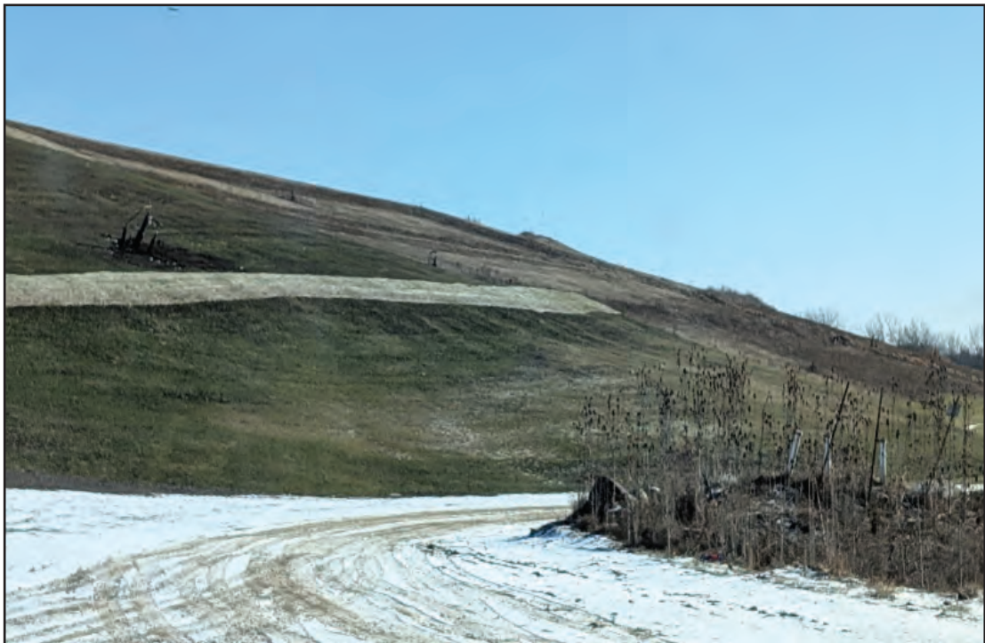
Capping project weathering nicely