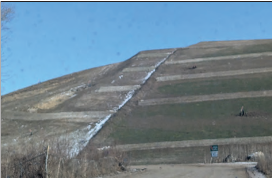
Junction of cap and intermediate cover on West slope of Phase 3