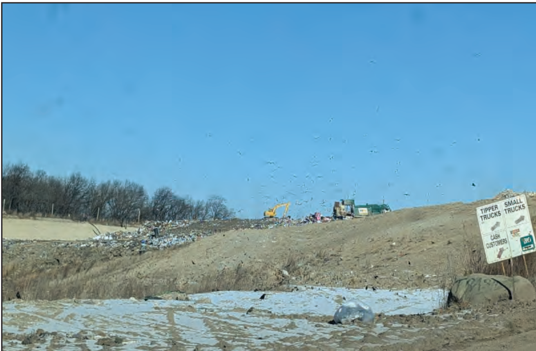
Working face in Northwest corner, deep fill