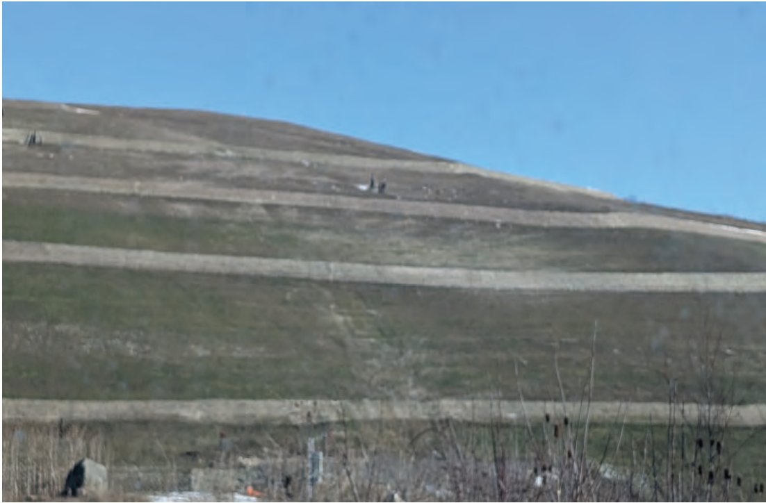
West slope of cap project, vegetation is developing quickly