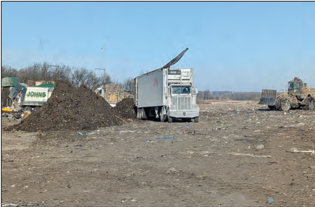
Auto-fluff being stockpiled