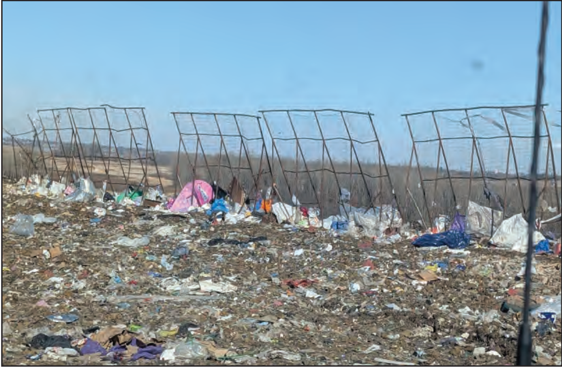
East edge of active are closed off with temp fencing to catch litter