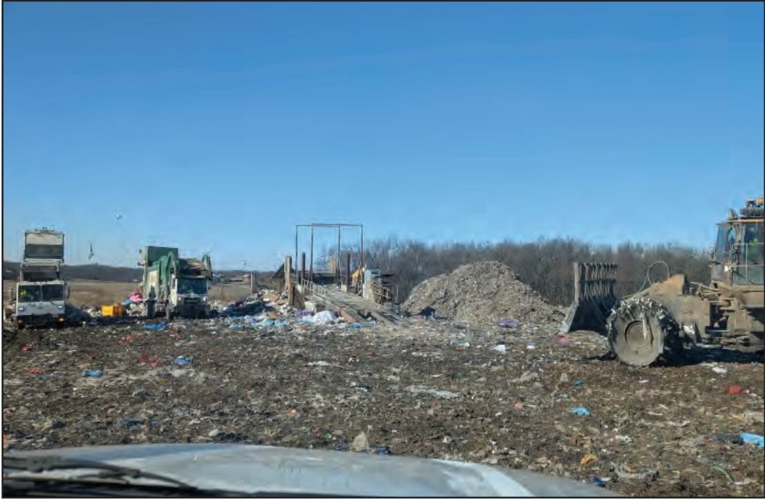
Wood chips for travel improvement stockpiled