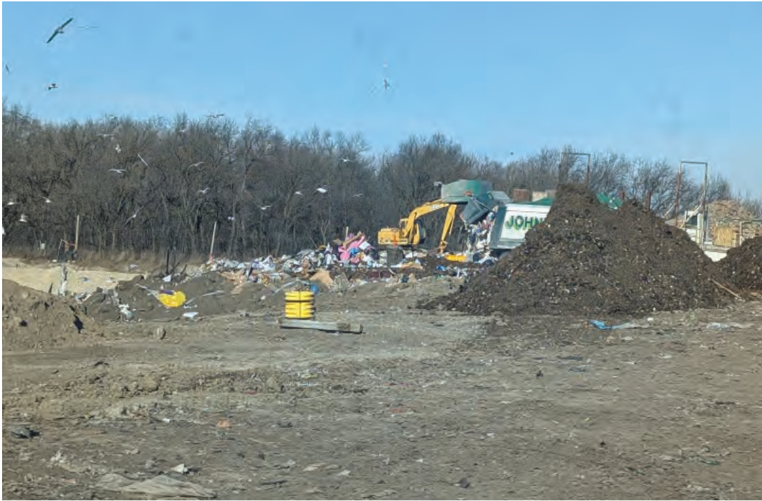
Working face in Northwest corner, deep fill